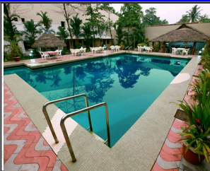
Alleppey & Trivendrum